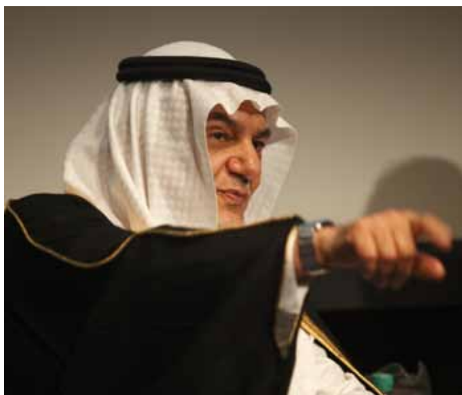
HRH Prince Turki Bin Faisal Al-Saud participating in the discussion at the 2011 GRM Opening Session

strong commitment to foster cooperation and promote exchanges such as the Gulf Research Meeting. Such collaboration opens the door to promote further work and link into a worldwide network of leading individuals and research initiatives.