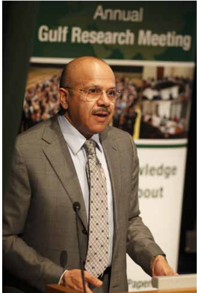
GCC Secretary-General H.E. Maj. Gen. Dr. Abdul Latif Bin Rashid Al-Zayani speaking at the Opening Session of the 2011 Gulf Research Meeting