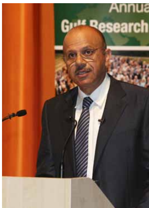
H.E. Maj. Gen. Dr. Abdul Latif Bin Rashid Al-Zayani

Secretary-General of the Gulf Cooperation Council