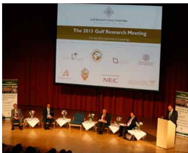
2013 GRM Opening Ceremony

Beyond the University of Cambridge, the GRM brings together institutions from throughout the world, thereby creating additional opportunities for networking and cooperation. Particular importance and emphasis is given to encourage young scholars, in particular from the GCC countries – including those studying abroad - to engage in the debate and take part in research collaboration. In this way, GRM provides a path into the future generation and the role it will play in shaping the region's development.