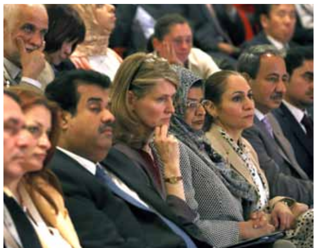
Audience at 2013 GRM Opening Ceremony