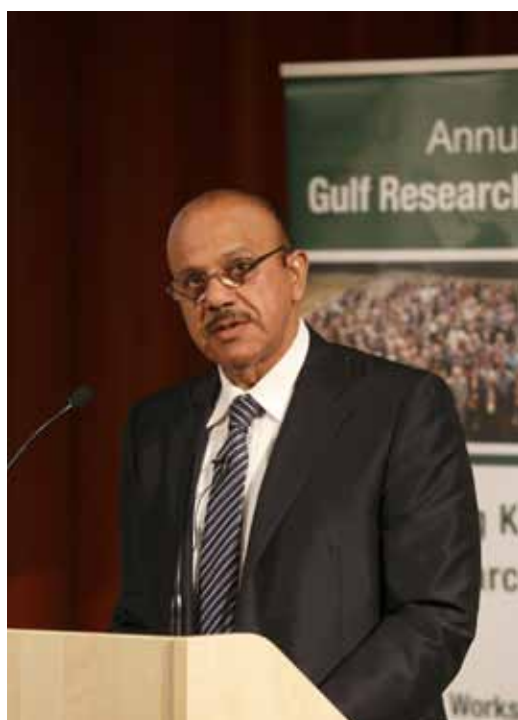
H.E. Dr. Abdul Latif Bin Rashid Al Zayani

Secretary General of the Gulf Cooperation Council (GCC)