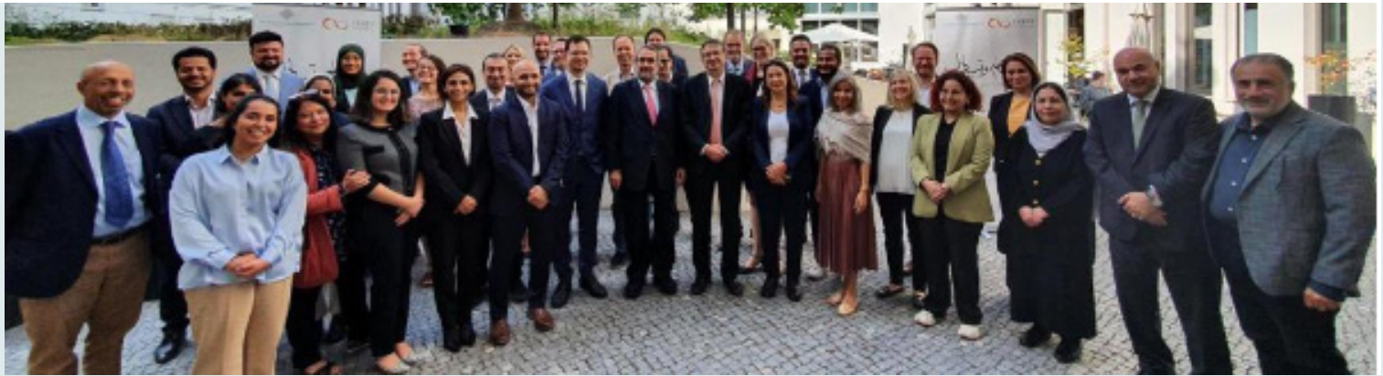
Group photo from the 4th Annual Tafahum Conference in Berlin, Germany

The fourth annual conference of the Tafahum wa Tabadul project brought together forty participants from throughout the Gulf region in Berlin, Germany to identify opportunities and openings where the regional and international community can create spaces for broader regional cooperation can begin to emerge. Within the context of establishing a comprehensive and wide-ranging regional security process, the region of West Asia and the Arabian Peninsula (WAAP) continues to be plagued by three main issues.