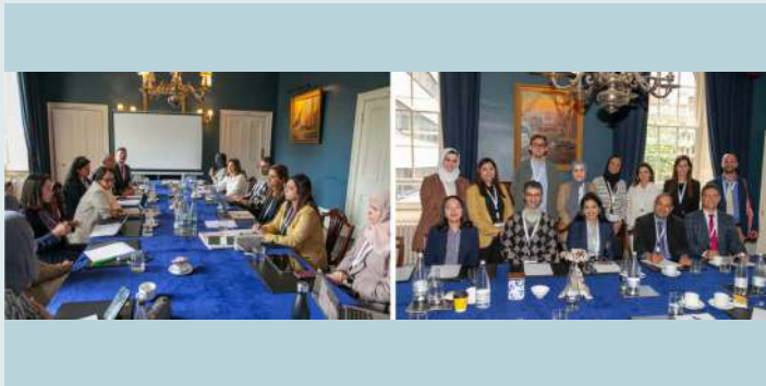
Workshop 9: Women in the GCC: Negotiating Leadership, Power, and Change