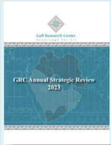
GRC Annual Strategic Review 2023 Access the full report here .