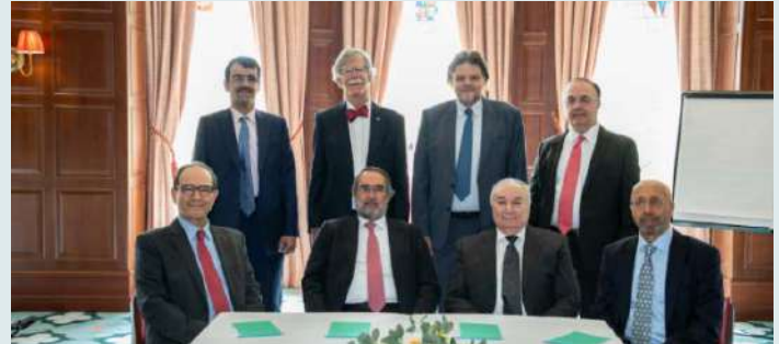
GRCC Council Meeting