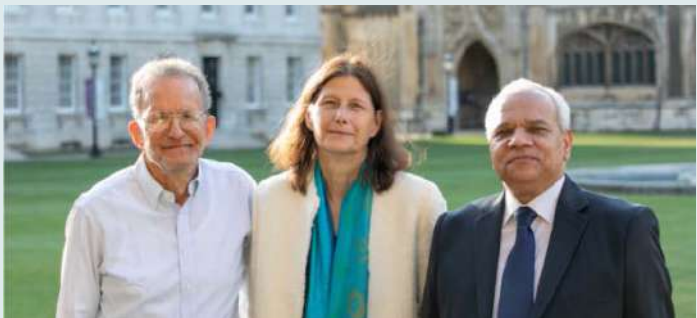
GRM 2023 participants and director gather in King's College for the GRM opening ceremony dinner.