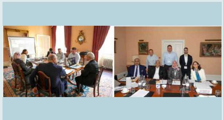
Workshop 4: Industrial Policies in the Gulf and the Middle East