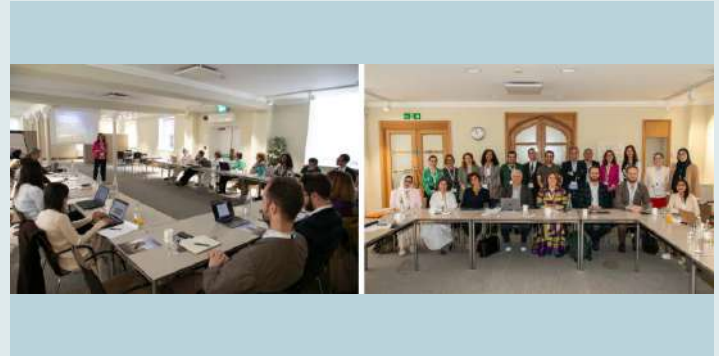
Workshop 8: Cultural Heritage in the Gulf – Emerging Trends, Identity Politics Challenges and Concerns