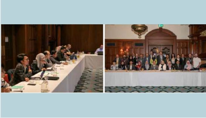
Workshop 1: Sustainable Development Financing and the Role of the Financial Sector in the GCC Region