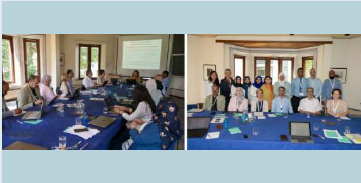
Workshop 7: The Leading Role of Gulf Higher Education in Achieving Sustainability and Addressing Climate Change