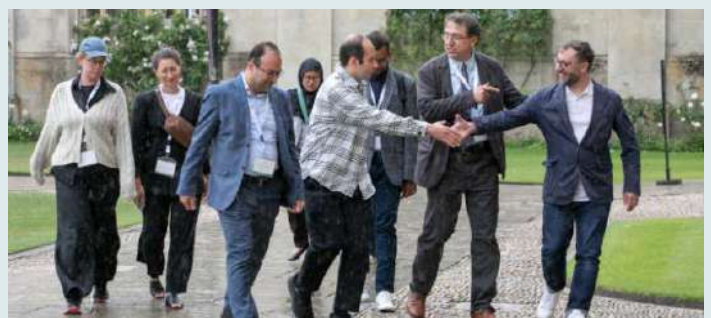
Workshop 1 participants making their way to King's College.