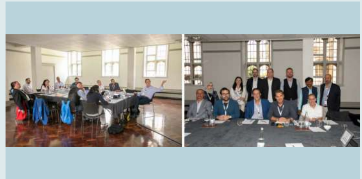
Workshop 10: Israel and the Gulf Monarchies: A New Regional Security Complex or Just Complex Regional Security?