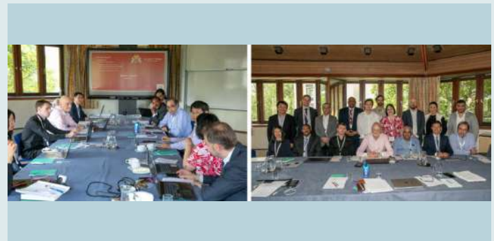
Workshop 12: The Gulf and the Horn of Africa: Trans-Regional Competition and Cooperation