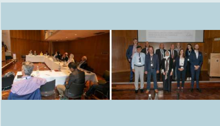
Workshop 5: The Renewed & Expanded Role of the Gulf on the Global Energy Scene