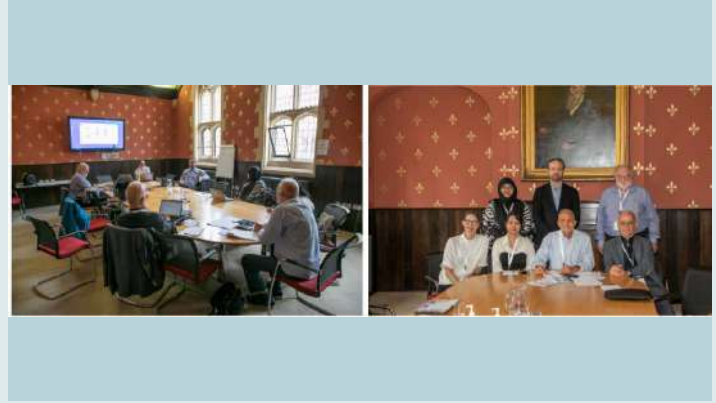
Workshop 2: Circular Economy and Sustainable Development Model: Its Role in the GCC States' National Visions