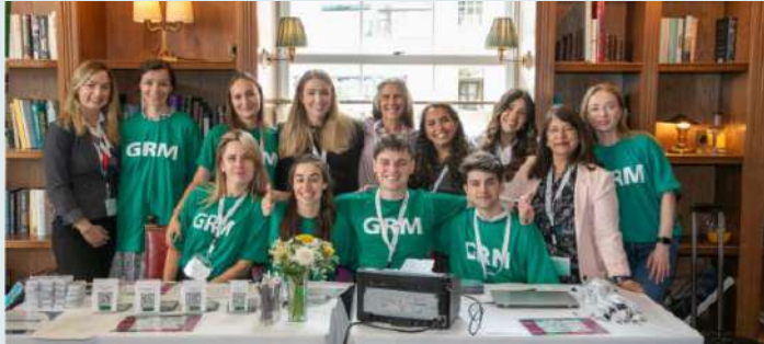
2023 GRM Participant Reception