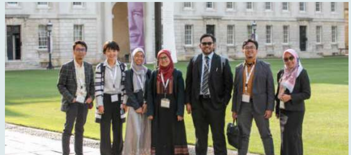
GRM 2023 participants gather at King's College.