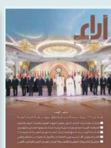
Araa Magazine # 187 (July 2023): Jeddah Summit 2023: A New Vision for Development and the Launch of Purification Efforts