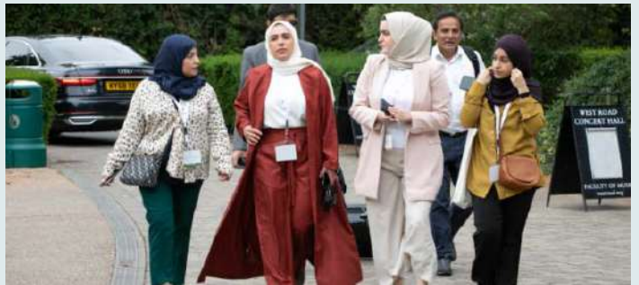
GRM 2023 participants making their way to King's College.