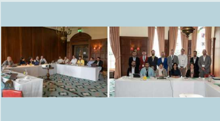
Workshop 3: Perspectives on Hard Security Issues in the Gulf