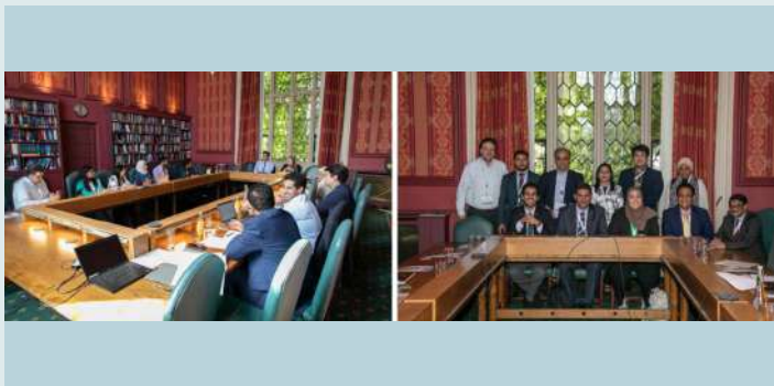
Workshop 11: The Future of the GCC as an Institution