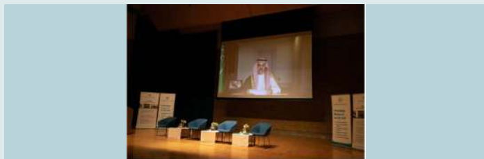
H.H. Prince Faisal bin Farhan Al-Saud, Foreign Minister of the Kingdom of Saudi Arabia, delivered his speech in the opening ceremony online.