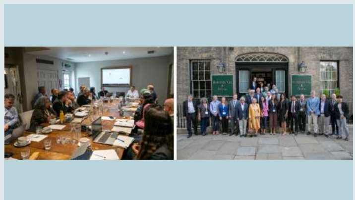
Workshop 6: Recent Labour and Migration Reforms and Policies in the Gulf: Impact on Economies and Societies