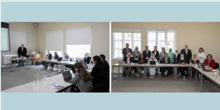
Workshop 13: Innovation and Development of Knowledge Societies – The Transformational Impact of Intellectual Property on Knowledge-Based Economic Growth with a Focus on Emerging Technologies, Artificial Intelligence, and IP Financing