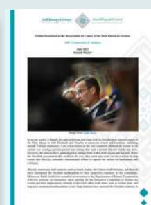
Global Reactions to the Desecration of Copies of the Holy Quran in Sweden Annah Mosly July 2023