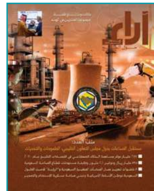
# 191 Relations Between the Gulf Cooperation Council Countries and ASEAN: Reality and Hopes November 2023