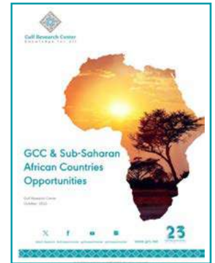
GCC & Sub-Saharan African Countries Opportunities Gulf Research Center November 2023