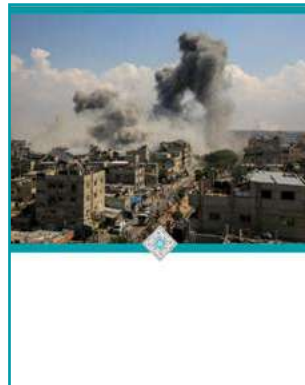
The Effect of the Gaps between North and South on the Crisis in Gaza Amnah Mosly November 2023