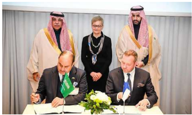
The Federation of Saudi Chambers and Business Finland signing an MoU to establish a joint Saudi-Finland Business Council (SPA, November 2022)

Arabia's Minister of Commerce, emphasized the need to benefit from Finland's expertise in research and development, the mining sector, education and training, and startups and innovation (Alhamawi, Lama, August 2023). Areas identified for better collaboration include the production of renewable energy, using hydrogen in industry and transportation, and advancing and implementing carbon capture technologies (SPA, November 2022). Saudi Arabia and Finland also signed an agreement to bolster air transport services to improve trade, boost tourism in Finland, as well as assist the Kingdom in achieving some of its objectives in the National Transport and Logistics Strategy.