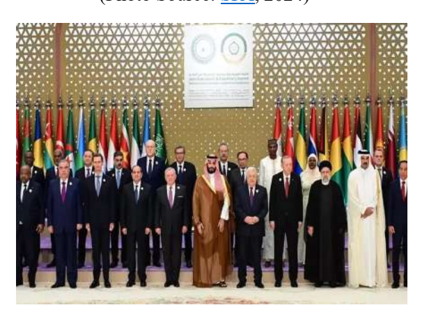
Extraordinary Arab-Islamic Summit