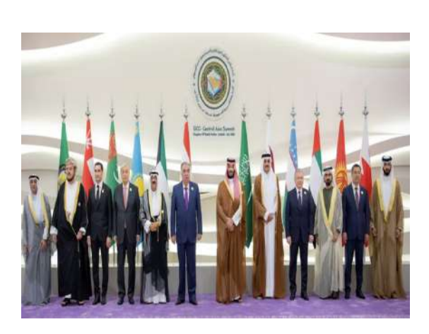
GCC-Central Asia (C5) Summit