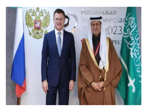
Saudi-Russian Joint Committee