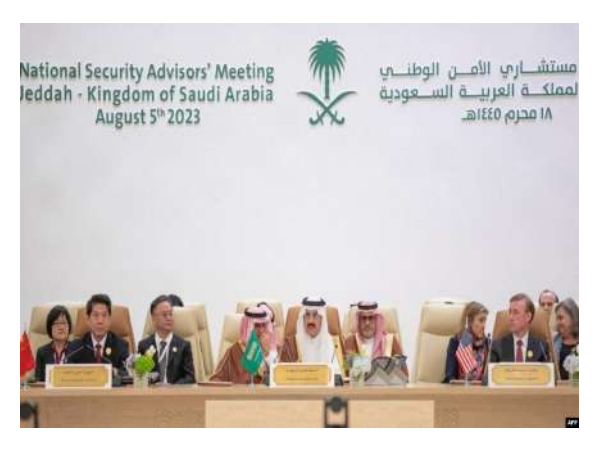
Jeddah Meeting on the Ukraine Crisis