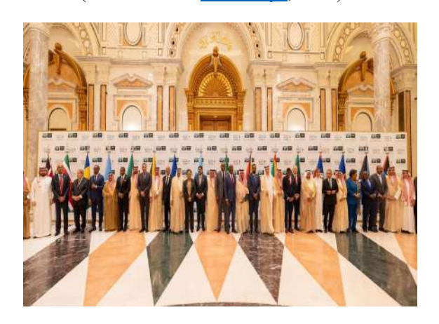
Saudi-Caribbean (CARICOM)