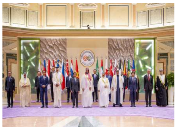
GCC-ASEAN Summit