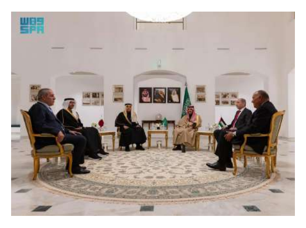
Ministerial Confab Summit (Photo Source: <u>SPA</u>, 2024)