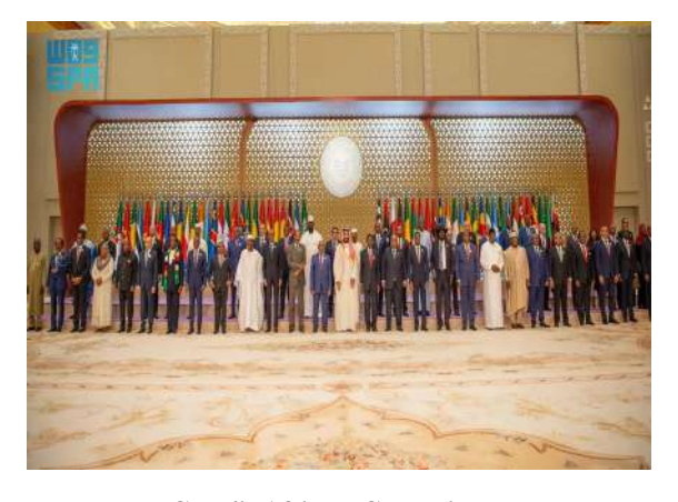
Saudi-African Summit