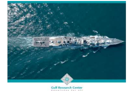
Gulf Research Center Security of the Red Sea Shipping Corridor: International Responsibilities and the Role of Japan