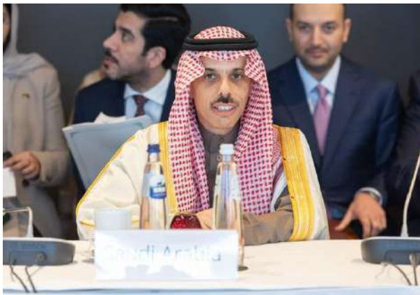
H.H. Prince Faisal bin Farhan, Saudi Arabia’s Minister of Foreign Affairs, co-chairing a meeting on a coordinated approach to the recognition of Palestine in Brussels, May 2024.

The meeting “stressed the importance of the international community’s recognition of the Palestinian state in order to adopt a comprehensive approach toward a reliable and irreversible path to implementing the two-state solution in accordance with international law and agreed standards, including UN resolutions and the Arab Peace Initiative” (Arab News, May 2024a). This active stance can be seen as an effort by Norway to promote peace and stability in the region.