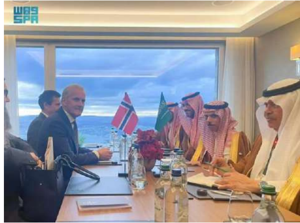
H.H. Prince Faisal bin Farhan, Saudi Arabia's Minister of Foreign Affairs, and Norway's Prime Minister H.E. Jonas Gahr Støre, on the sidelines of the Summit on Peace in Ukraine, held in Lucerne, Switzerland, June 2024.

The political landscape surrounding Norway and the GCC has been significantly influenced by two major crises: The ongoing wars in Palestine and Ukraine. These crises have not only led to increased dialogue and consultation between the two sides but have also brought them closer in terms of political cooperation and engagement, highlighting the high level of convergence of interests and shared concerns.