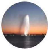
Gulf Research Center Jeddah (Main office)

19 Rayat Alitihad Street P.O. Box 2134 Jeddah 21451 Saudi Arabia Tel: +966 12 6511999 Fax: +966 12 6531375 Email: info@grc.net