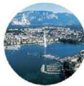
Gulf Research Center Foundation Geneva

Unit FN11A King Faisal Foundation North Tower King Fahd Branch Rd Al Olaya Riyadh 12212 Saudi Arabia Tel: +966 112112567 Email: info@grc.net