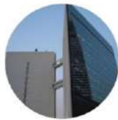
Gulf Research Center Riyadh

19 Rayat Alitihad Street P.O. Box 2134 Jeddah 21451 Saudi Arabia Tel: +966 12 6511999 Fax: +966 12 6531375 Email: info@grc.net