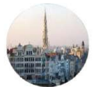
Gulf Research Center Foundation Brussels

University of Cambridge Sidgwick Avenue, Cambridge CB3 9DA United Kingdom Tel: +44-1223-760758 Fax: +44-1223-335110