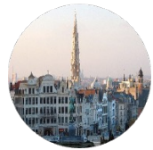
Gulf Research Center Foundation Brussels

University of Cambridge Sidgwick Avenue, Cambridge CB3 9DA United Kingdom Tel: +44-1223-760758 Fax: +44-1223-335110