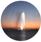
Gulf Research Center Jeddah (Main office)

19 Rayat Alitihad Street P.O. Box 2134 Jeddah 21451 Saudi Arabia Tel: +966 12 6511999 Fax: +966 12 6531375 Email: info@grc.net