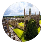
Gulf Research Centre Cambridge

Avenue de France 23 1202 Geneva Switzerland Tel: +41227162730 Email: info@grc.net