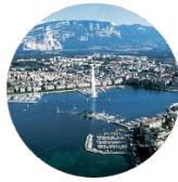
Gulf Research Center Foundation Geneva

Unit FN11A King Faisal Foundation North Tower King Fahd Branch Rd Al Olaya Riyadh 12212 Saudi Arabia Tel: +966 112112567 Email: info@arc.net