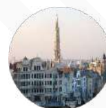
Gulf Research Center Foundation Brussels

University of Cambridge Sidgwick Avenue, Cambridge CB3 9DA United Kingdom Tel: +44-1223-760758 Fax: +44-1223-335110