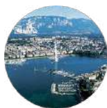
Gulf Research Center Foundation Geneva

Unit FN11A King Faisal Foundation North Tower King Fahd Branch Rd Al Olaya Riyadh 12212 Saudi Arabia Tel: +966 112112567 Email: info@grc.net