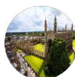
Gulf Research Centre Cambridge

Avenue de France 23 1202 Geneva Switzerland Tel: +41227162730 Email: info@grc.net