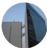
Gulf Research Center Riyadh

19 Rayat Alitihad Street P.O. Box 2134 Jeddah 21451 Saudi Arabia Tel: +966 12 6511999 Fax: +966 12 6531375 Email: info@grc.net