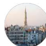
Gulf Research Center Foundation Brussels

University of Cambridge Sidgwick Avenue, Cambridge CB3 9DA United Kingdom Tel: +44-1223-760758 Fax: +44-1223-335110