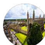
Gulf Research Centre Cambridge

Avenue de France 23 1202 Geneva Switzerland Tel: +41227162730 Email: info@grc.net