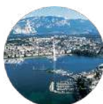
Gulf Research Center Foundation

Unit FN11A King Faisal Foundation North Tower King Fahd Branch Rd Al Olaya Riyadh 12212 Saudi Arabia Tel: +966 112112567 Email: info@grc.net