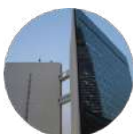
Gulf Research Center Riyadh

19 Rayat Alitihad Street P.O. Box 2134 Jeddah 21451 Saudi Arabia Tel: +966 12 6511999 Fax: +966 12 6531375 Email: info@grc.net