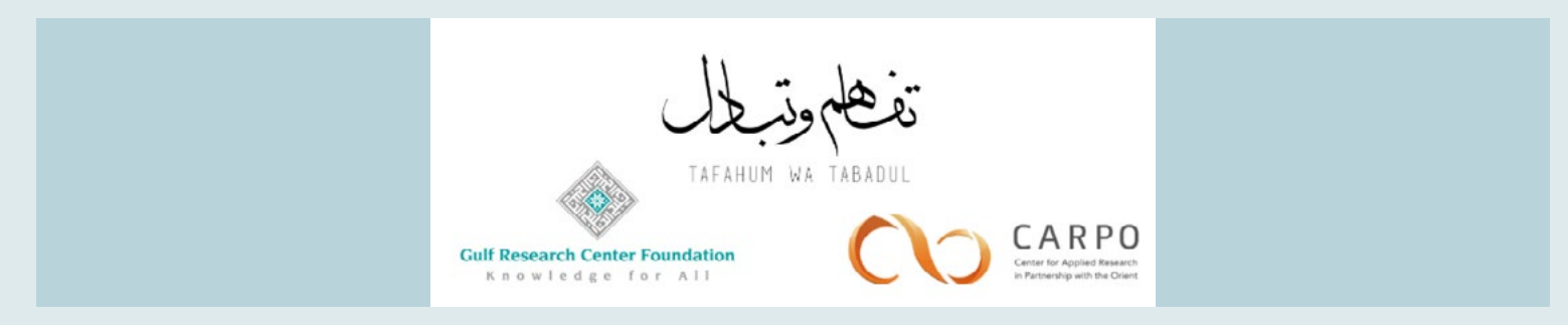
Enhancing Multi-Track Dialogue and Cooperation in West Asia and the Arabian Peninsula 2nd High-Level Policy Workshop May 10-11, 2023

The Tafahum wa Tabadul project organized the second high-level policy workshop in Montreux, Switzerland, which aimed at building a comprehensive assessment of the current regional dynamics. This constructive workshop brought together official representatives from the West Asia and the Arabian Peninsula (WAAP) region. The