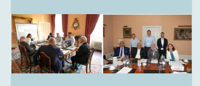
Workshop 4: Industrial Policies in the Gulf and the Middle East