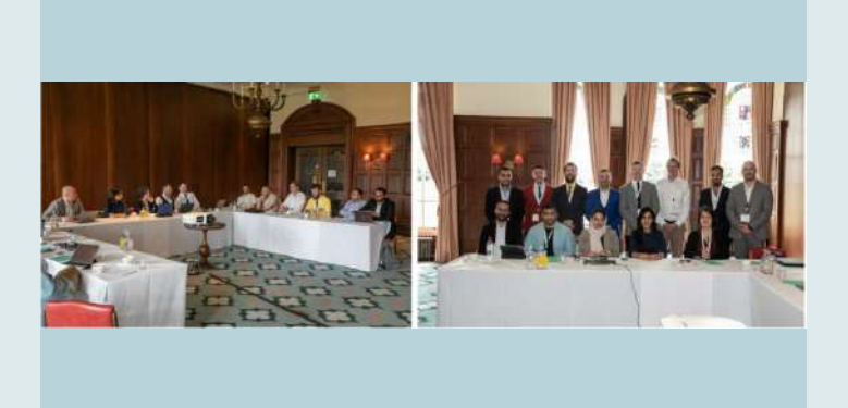
Workshop 3: Perspectives on Hard Security Issues in the Gulf