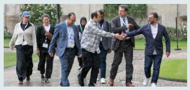
Workshop 1 participants making their way to King's College.