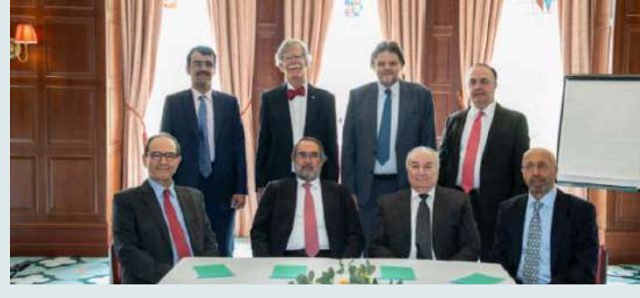
GRCC Council Meeting