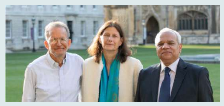
GRM 2023 participants and director gather in King's College for the GRM opening ceremony dinner.