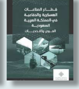
Defense in the Kingdom of Saudi Arabia: Opportunities and Challenges Facing the Sector Gulf Research Center