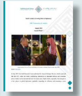
Saudi Arabia's Growing Role in Diplomacy Amnah Mosly August 2023